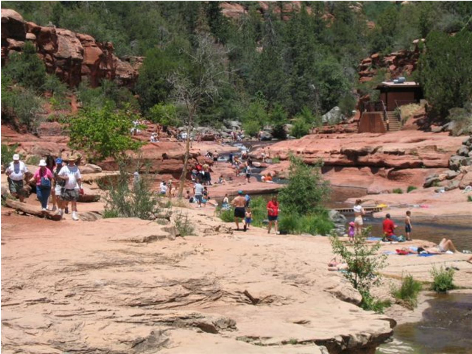
Slide Rock—Normal Summer Flows