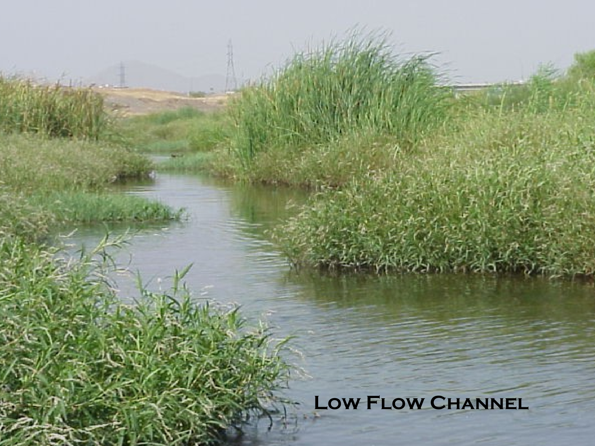
LOW FLOW CHANNEL