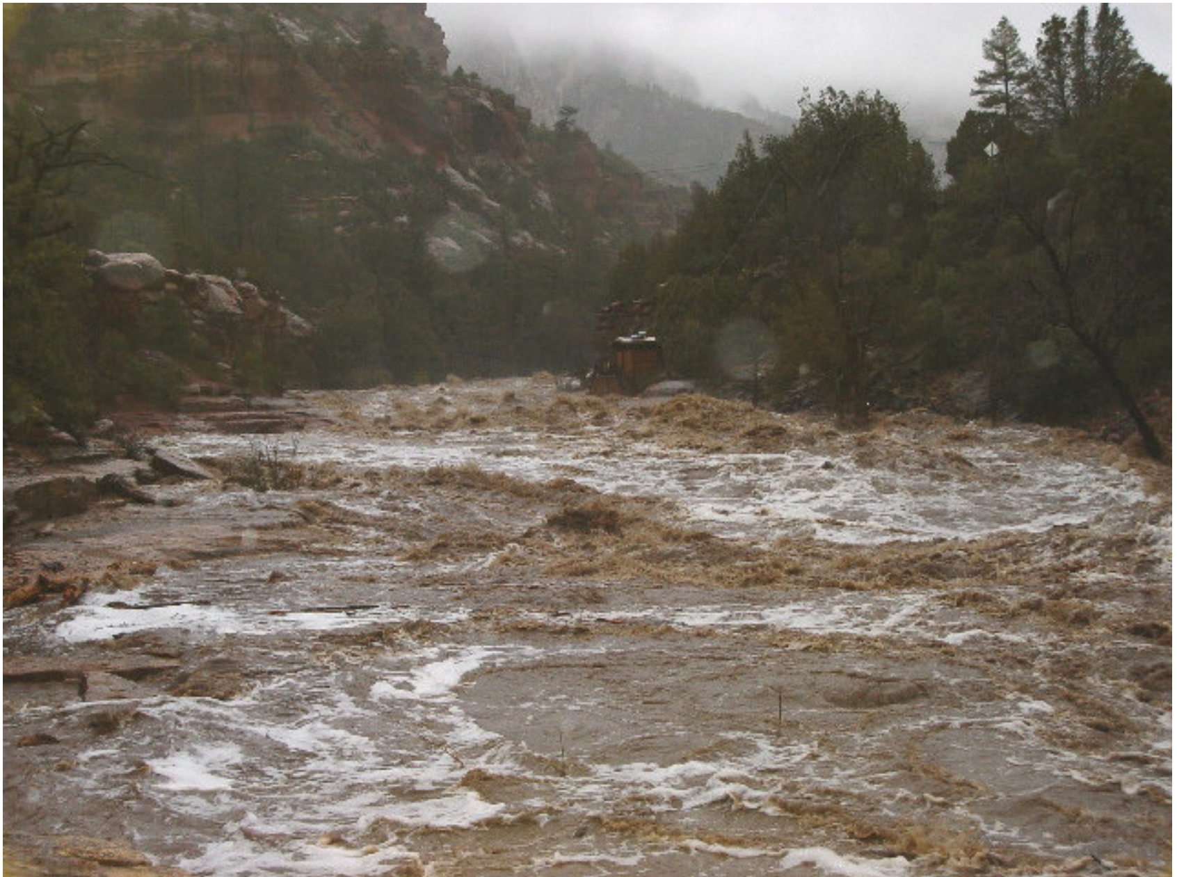
Slide Rock—December 29, 2005