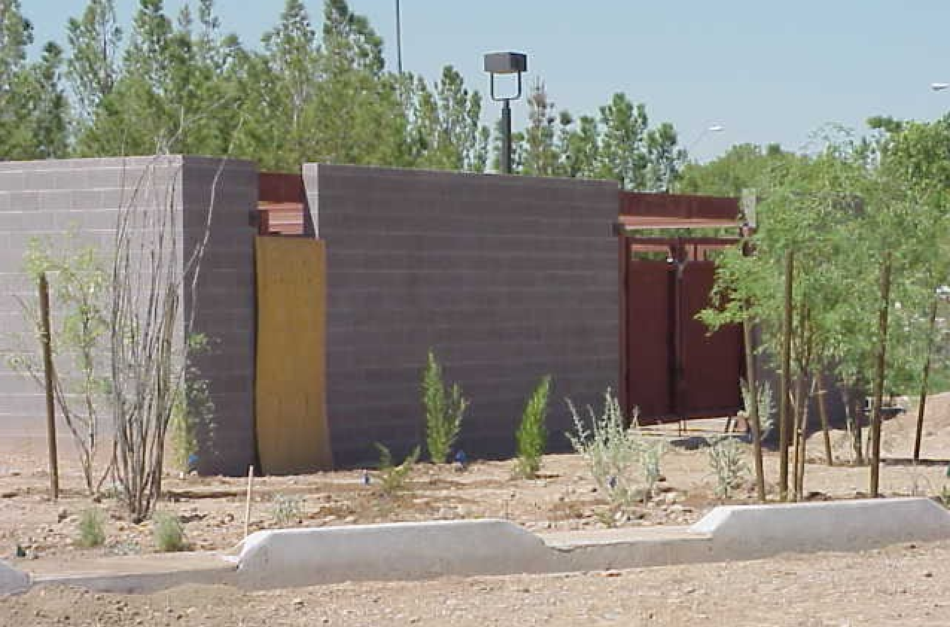
PHASE 1 A WELL ENCLOSURE