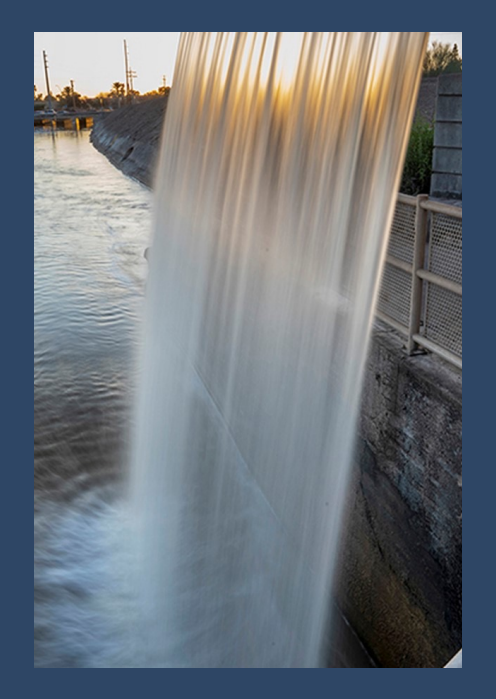
HIGH COSTS, FEW INCENTIVES

Cooling towers use water to cool buildings. Aviation made their system efficient.