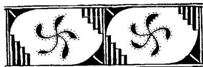
San Ildefonso water jar design

With the moment ripe for productive negotiations, Governor Bruce Babbitt appointed an 18-member