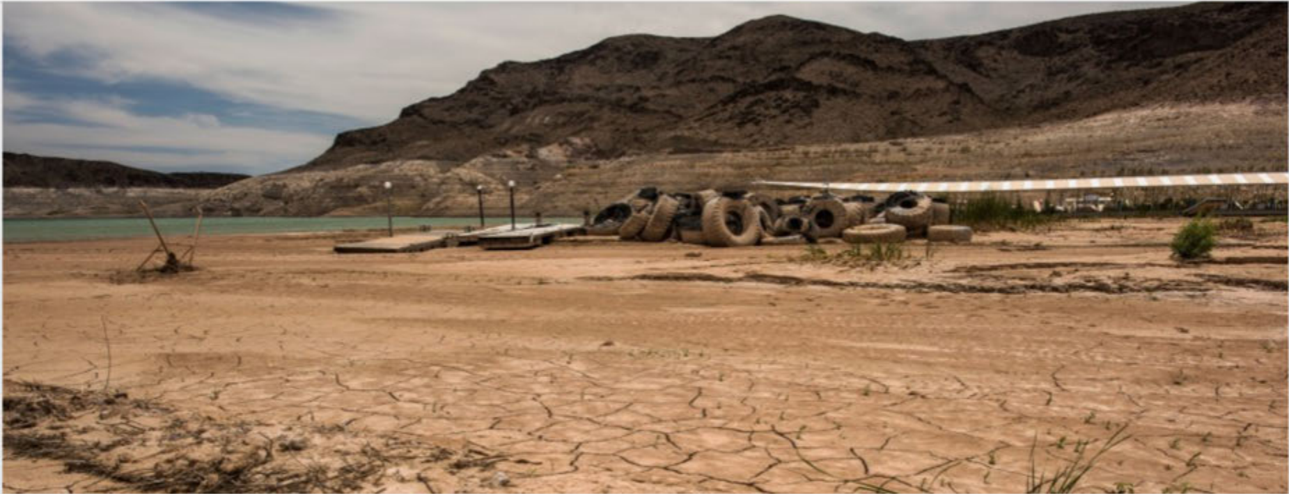
Boat docks sit on what used to be the bottom of Lake Mead at the abandoned Echo Bay Marina in Overton, Nev., on June 4, 2015.