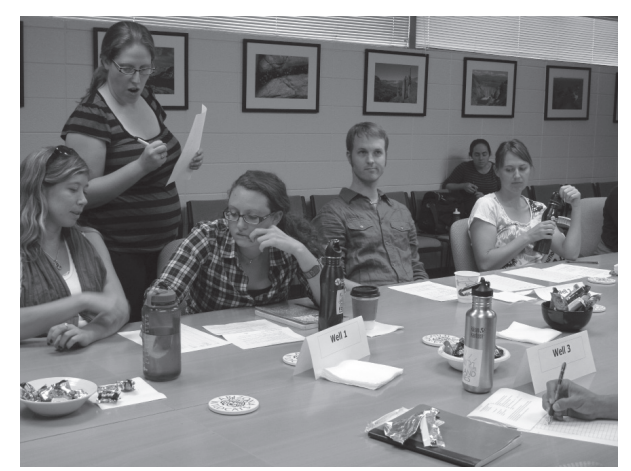
University of Arizona graduate students took part in a role-playing game that simulates the behavior of irrigators who share a groundwater source.

In the simulation Van Weert divided the students in 10 "families" wherein each one had to make a decision about how much land, out of a possible 100 hectares (247 acres), to bring under production in a fictional agricultural community. land would mean more revenue generated. However, if each family produced their full 100 hectares, they would collectively draw down the groundwater so as to starve the nearby lake of the necessary water levels. In this case, there would be no fish for the families and each