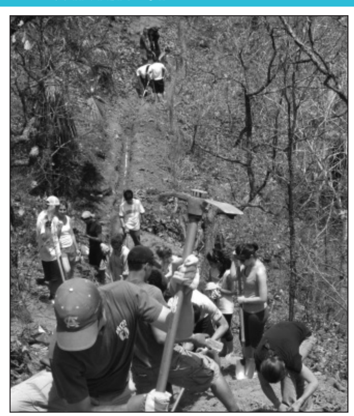
UA Global Water Brigade helps to install a pipeline in El Canton, Honduras.

Again, the City of Phoenix had a long history of very proactive water management; proactively acquiring water supplies and building