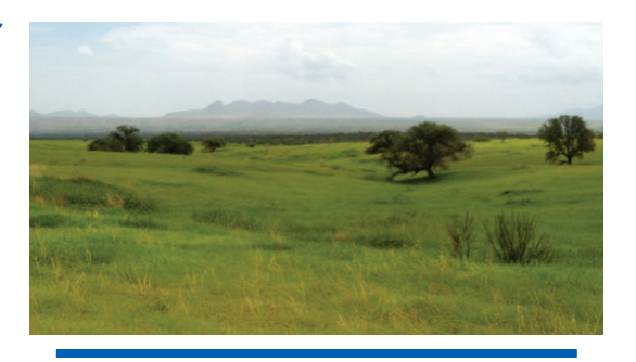
Roadmap Case Study: Las Cienegas National Conservation Area includes a large educational component that has contributed to the project's success. Photo: LCNCA landscape by Shela McFarlin.

Although the need for education was a common theme throughout the Roadmap building process, recommended strategies for how to go about education varied among regions and within discussion groups. There was, however, consensus that any educational program should make use of existing resources and involve simple, clear messaging. Two frequently discussed themes were education on: 1) how all water-using sectors benefit natural areas, as well as how they use and conserve water; and 2) the history, heritage, and importance of Arizona's riparian and aquatic ecosystems. The primary recommendation that emerged during the Roadmap development process for improving education on water resources and water for natural areas is to bring people together to identify funding sources, set curriculum, and prioritize desired audiences for an educational campaign. Participants indicated that this should be done by forming a statewide water-education advisory committee,