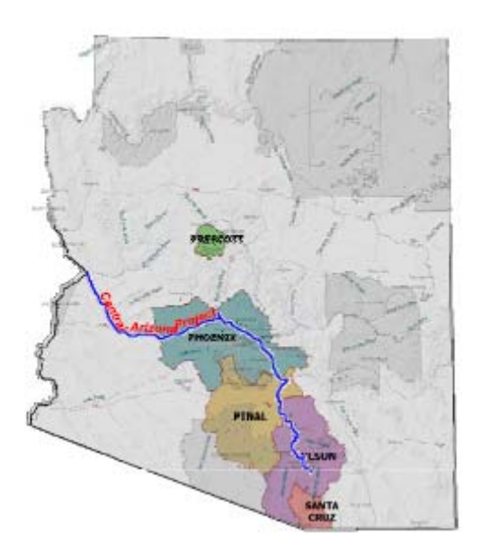
Figure 1. Arizona's Active Management Areas

While the federal government fronted the $4 billion cost of constructing the canal, Arizona was to repay a large portion of the cost over time. Arizona established the Central Arizona Water Conservation District (CAWCD) to oversee project operations and the repayment. An important clause in the repayment contract held that the state would pay 3.3% interest on the portion of the project delivering municipal and industrial water, while deliveries of agricultural water would be interest-free. So, it was in the state's financial interest to encourage agricultural use of CAP water.