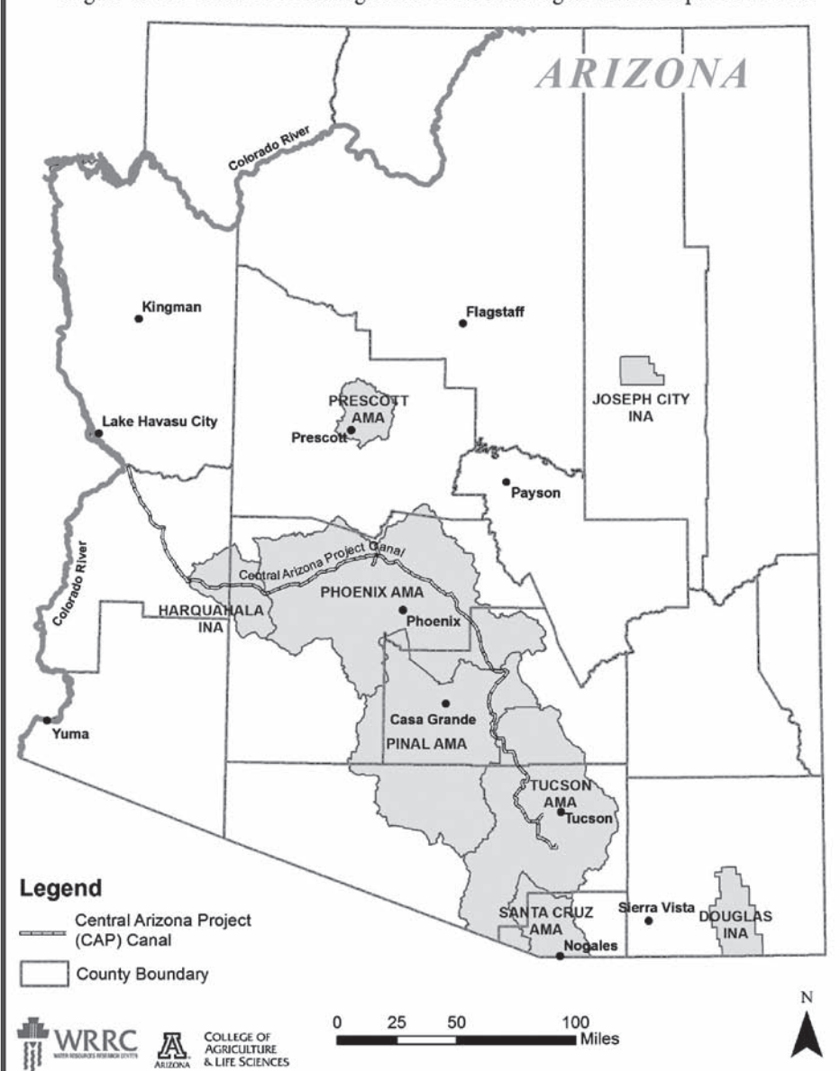
Figure 1: Arizona Active Management Areas and Irrigation Non-Expansion Areas

Prescott, and Tucson AMAs have safeyield as their water management goal. The goal for the largely agricultural Pinal AMA is "to allow development of nonirrigation uses...and to preserve existing agricultural economies in the active management area for as long as feasible, consistent with the necessity to preserve future water supplies for non-irrigation uses." The Santa Cruz AMA goal is "to maintain a safe-yield condition in the active management area and to prevent local water tables from experiencing long-term declines." This goal recognizes the shallow aquifer conditions or microbasins in parts of the Santa Cruz AMA and effectively connects groundwater use to the surface water flows that recharge these micro-basins. The non-AMA portions of Arizona are not subject to groundwater regulation.