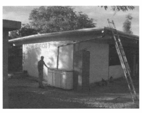
Rainwater collection system at Covarrubias Elementary School, Nogalas, Sonora

If only ten percent of the population captured and stored the rainfall on their roofs approximately 600 million gallons (2,000 acre-