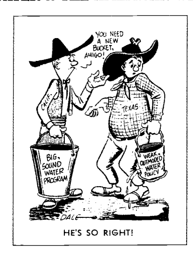
Editorial cartoon first published in San Antonio (TX) Express and republished in Western Water News, July, 1956.