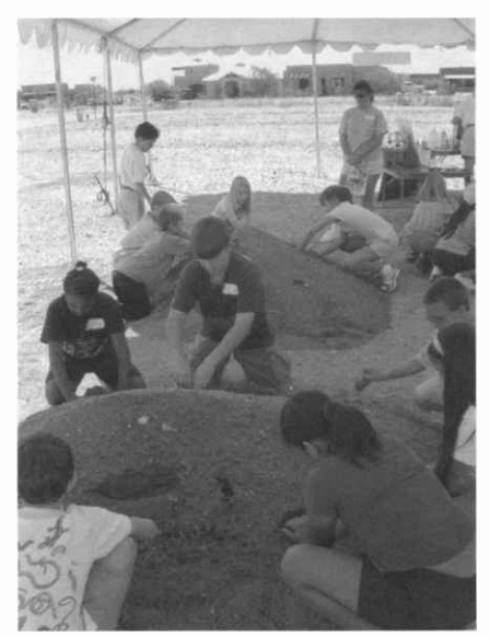
Arizona Game and Fish and EPA are sources of environmental education funding. (See notices on this page.) Above, students work on a water harvesting experiment in a WRRC Project WET presentation.

The Environmental Protection Agency (EPA) is soliciting grant proposals from educational institutions, environmental and educational public agencies and not-for-profit organizations to support environmental education projects. A notice appeared in the Federal Register (65 FR 53146, Aug. 31, 2000). The Environmental Education Grants Program provides financial support to projects that design, demonstrate, or disseminate environmental education practices, methods, or techniques. Non-federal matching funds of at least 25 percent of total cost of the project is required. For more information visit http:// www.epa.gov/enviroed Nov. 15 is deadline for submitting applications.