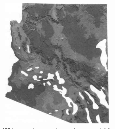
White areas shown on the map have potential for geothermal resources.

Water temperatures lower than what is needed to generate electricity also have