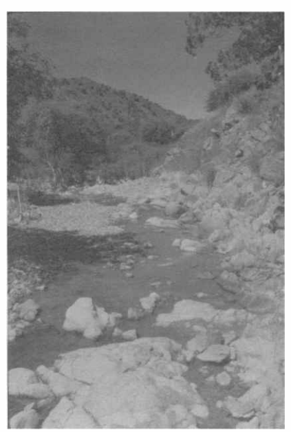
Pima County's Sonoran Desert Conservation Plan mapping identified 55 perennial and 82 intermittent reaches for 74 different streams and more than 250 springs in Pima County. Nearly 100 potential shallow groundwater sites are identified, and some of the larger ones have been delineated.

For more information on this complex plan, along with text of major documents, a complete list of studies and ordering information, see Pima County web site www.co.pima.az.us/cmo/sdcp/