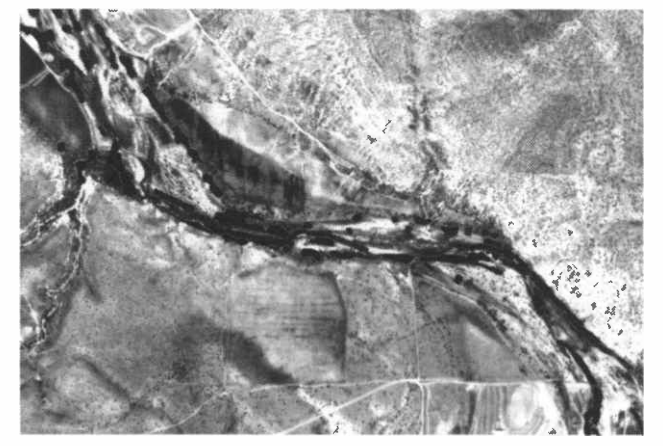
The study area near Cottonwood in 1968

To interpret the aerial photos (scale range 1:12,000 to 1:30,000) researchers are viewing the photos using a stereoscope and then digitizing tree stand polygons directly onto the scanned photographs using ArcView. Two classes of vegetation will be mapped. These are Fremont cottonwood/Goodding willow (Populus fremontii/Salix gooddingi) and velvet mesquite (Prosopis velutina).