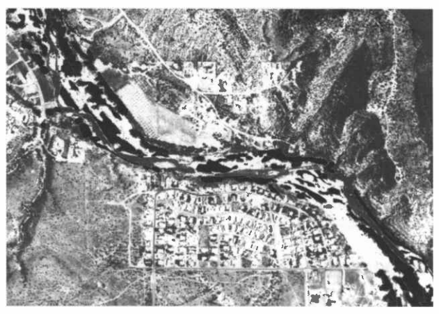
The study area near Cottonwood in 1995

and industrial/commercial, with others designated if necessary. The river channel will also be mapped as well as bare sediment along the channel.