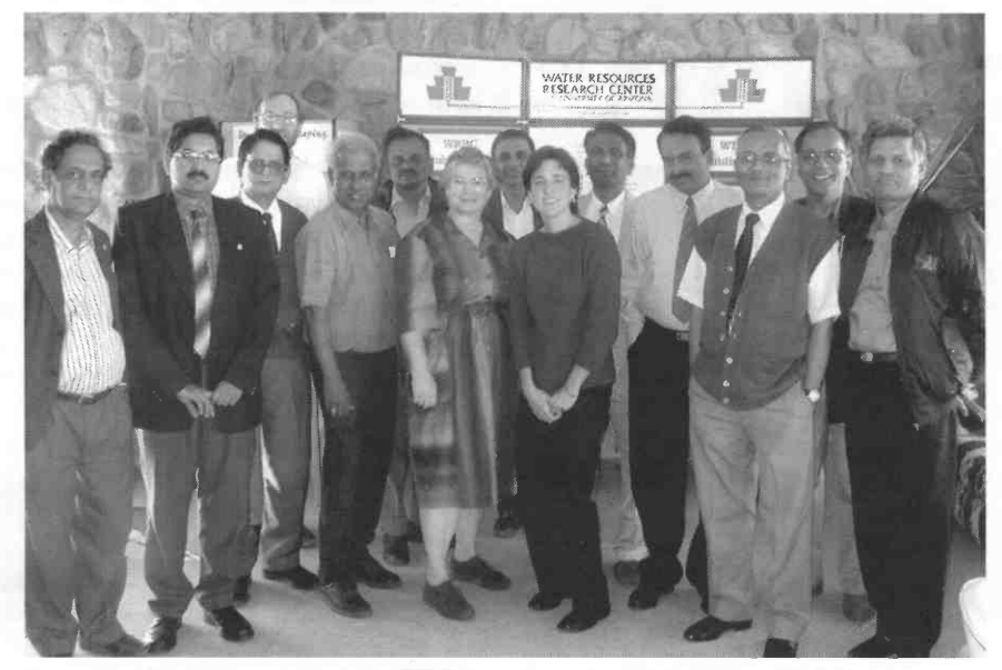
Above are visitors from India with WRRC staff members. The Indians visited the center for a briefing on Arizona water issues and WRRC programs.

In January, WRRC hosted visitors from India on a 2-week study tour of the western United States. They are senior level managers in a World Bank-financed project to implement a data acquisition and manage-