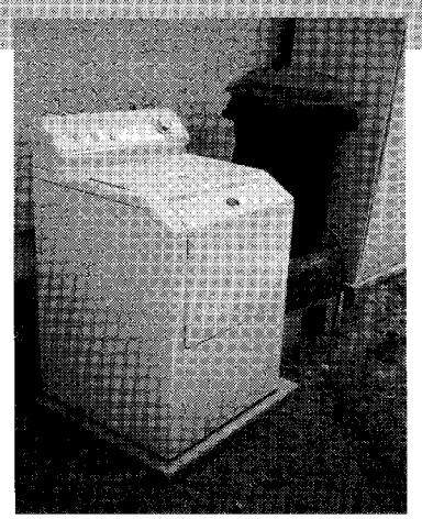
Standard domestic graywater system—washing machine and surge tank.

The proposed rules differ for residential graywater irrigation systems with a flow between 400 gallons and 3,000 gallons per day. In this situation, a general permit with verification would be issued providing the system satisfies design and installation criteria con-