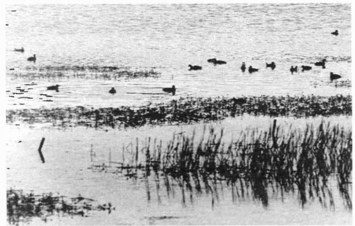
Waterfowl swim in Jacques Marsh, a constructed wetlands near Pinetop, Arizona.

Across Arizona, the operations of a number of reservoirs are being revised to include downstream values beyond the traditional irrigation and municipal water delivery. As a result of the widespread degradation of riparian ecosystems downstream of dams, and the recognition of federally and state listed endangered species, the restoration of these highly productive systems has become a major component of many multi-purpose dam management plans. Ultimately, the success of any flow release schedule formulated to restore riparian vegetation will depend on the creation of an ecological database. The objective of this study is to determine the physical conditions and processes necessary to restore riparian habitats downstream from dams in the Sonoran Desert region of Arizona. Information will include quantification of tree establishment frequency, historical establishment and present day conditions, and survivorship of riparian vegetation in above- and below-dam reaches of the Agua Fria and Bill Williams Rivers. Principal Investigators: Juliet C. Stromberg and Duncan T. Patten, ASU; and Patrick B. Shaforth and Lee S. Ischinger, National Biological Survey.