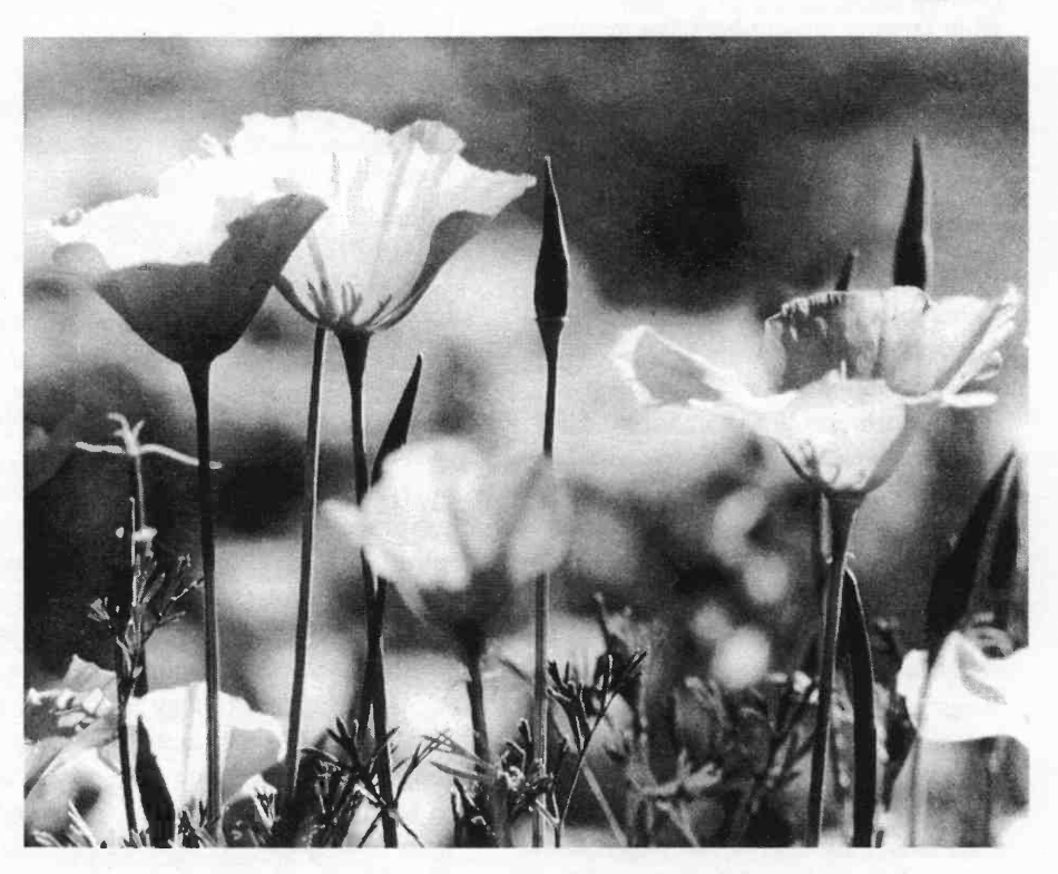
Ample rainfall and moderate temperatures since November promise the best show of desert flowers this spring in a decade. Allergy sufferers may experience record pollen levels, however.