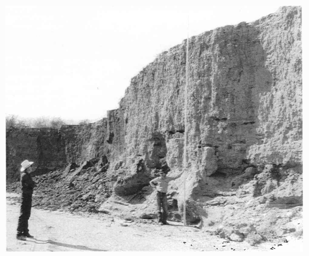
The eroded banks of Brawley Wash are measured. Brawley Wash runs north from Sonora, Mexico through the Avra-Altar Valleys toward Marana, Arizona. The Soil Conservation Service and the Pima Natural Resource Conservation District have issued a report recommending an innovative strategy to restore the wash.

For more information and a copy of the report, contact the Soil Conservation Service in Phoenix at 602-640-2549.