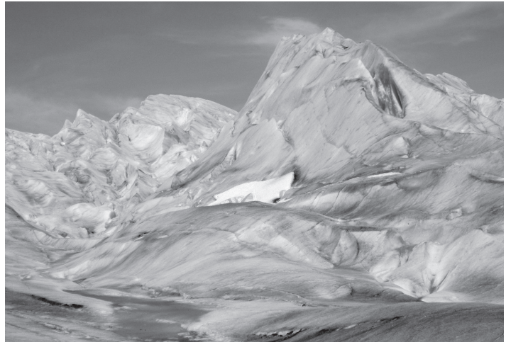
Herbert Glacier in the Juneau Icefield, Alaska.

It has also been interesting to see how climate change is addressed. Again, my information is anecdotal but interesting to me. As we rode to our Juneau helicopter excursion, the young van driver spoke of how they in the area do not believe in climate change. The main reason he gave was that some glaciers are gaining in size. It was exhilarating to land on a glacier and bend down and drink some running water. The more frequent comments had to do with how many glaciers are losing