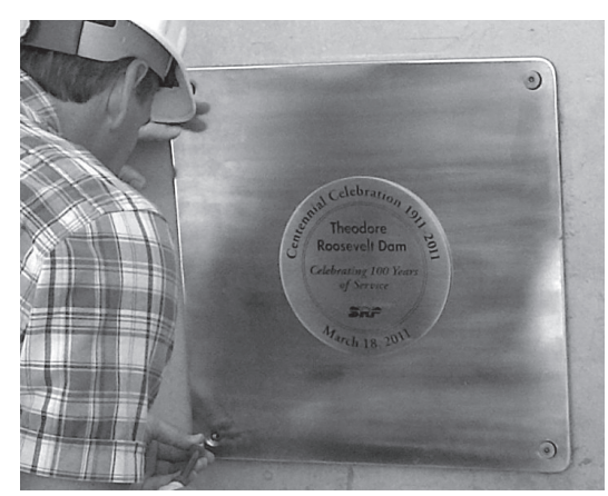
The Roosevelt Dam Centenial time capsule is installed at the dam.

area of the dam, where it will remain until it is opened for the structure's 150th anniversary in 2061. The new time capsule replaces the original version that was installed at the dam in 1961 and opened in the spring of 2011. The capsule is filled with items that were suggested by employees and customers of the Salt River Project (SRP) to best describe how water and power have impacted residents of the Salt River Valley. Items include a digitized Roosevelt Dam Centennial video, paper Salt River Project power and water bills, an aerial photo of metro Phoenix, and an incandescent light bulb. Background information, diagrams and