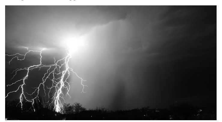
Monsoon lightning accompanies a summer downpour in Southern Arizona.

Campus," was initiated to collect and measure condensate from air conditioning (AC) units at the WRRC. AC units generate gallons of high-quality condensate (water) from out of the air. This water is mostly going down the drain or evaporating, rather than being put to a beneficial use in a region where water is a limited resource. In this pilot project, two AC units will be monitored and the weather station will provide temperature, precipitation and humidity data that will be analyzed for correlations with condensate production. The data generated will be used to quantify potential AC condensate to augment water supplies.