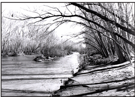
San Pedro River.

a very busy agenda. It is tasked with devising a comprehensive plan for conserving and reusing water in the area as well as identifying water supply augmentation strategies. Further, the board is to consider ways to organize a permanent water district and elect its members. Financial matters are also within the board's purview; it is to determine the cost of meeting established goals and identifying the means of raising money to cover costs.