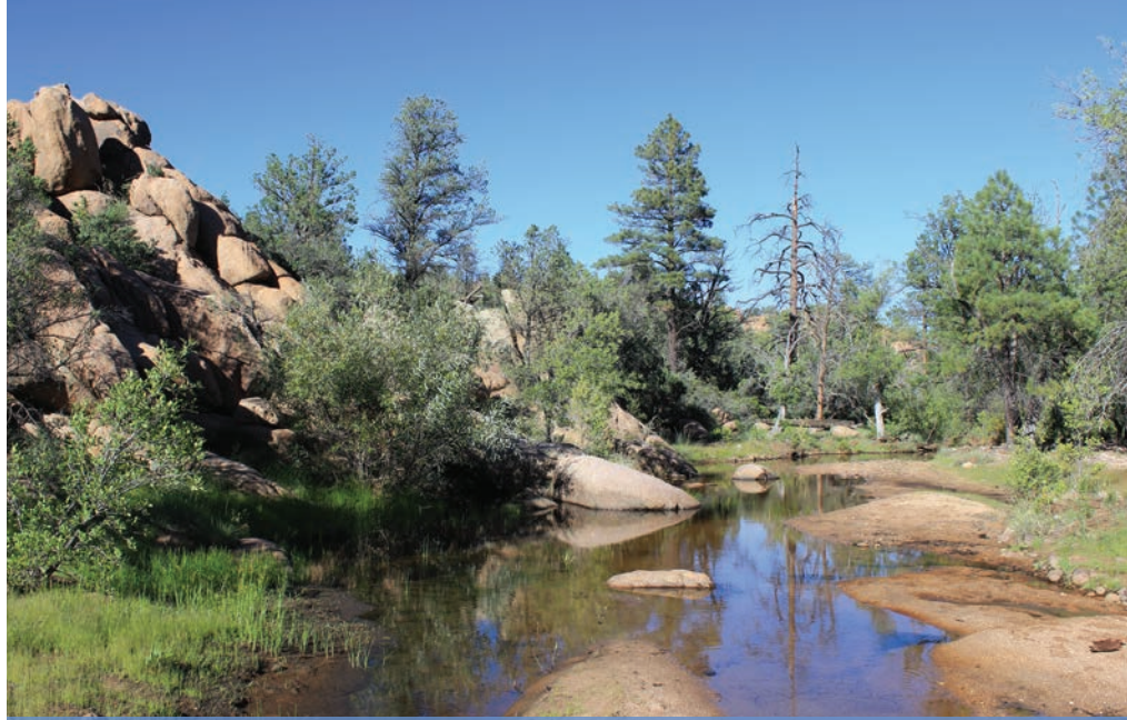
Apache Creek, Apache Creek Wilderness, Prescott National Forest.