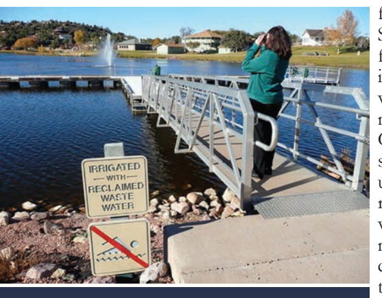
Payson Green Valley Lake

To stay on top of ADEQ's rulemaking effort and be notified of opportunities for public comment, please send an email to reuserulemaking@azdeq.gov.