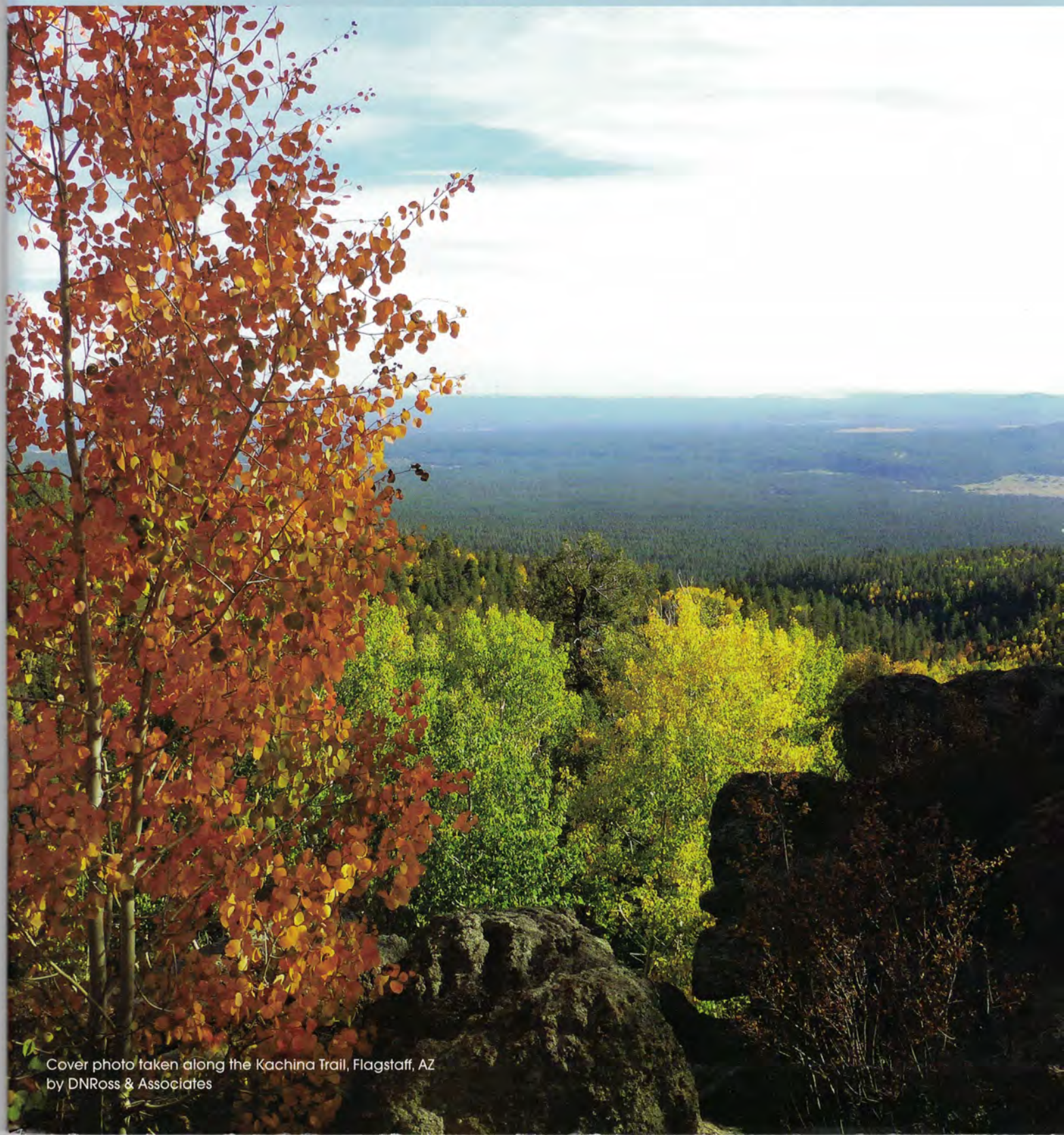
Cover photo taken along the Kachina Trail, Flagstaff, AZ

Fall 2016 | www.azwater.org Arizona Section AWWA | Arizona Member Association WEF