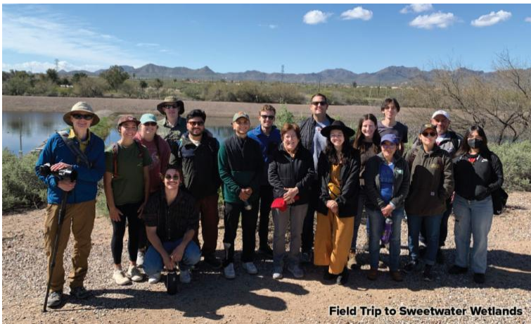
Field Trip to Sweetwater Wetlands