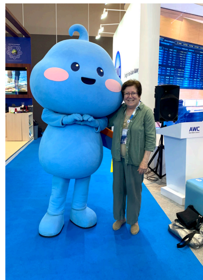
May 20, 2024 at the World Water Forum Expo

I am grateful that I had the opportunity to participate in the 10 th World Water Forum, learn about Bali's rich history and water practices, and interact with so many gracious people.