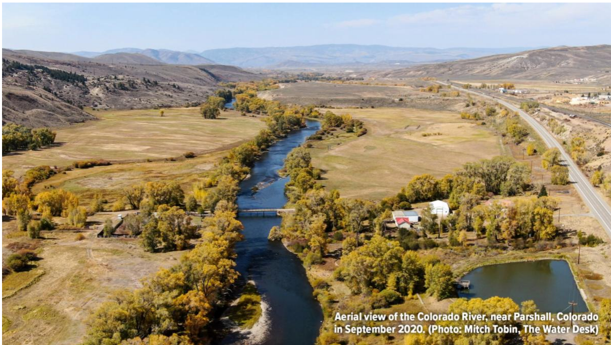
Aerial view of the Colorado River, near Parshall, Colorado in September 2020.

Reflections, Brown Bag Recap, Kirk Scholarship, APW, UCOWR/NIWR, Debra Krol