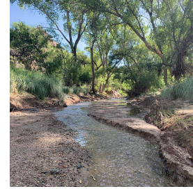
Image: Cienega Creek Watershed