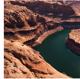
Image: Colorado River Aerial