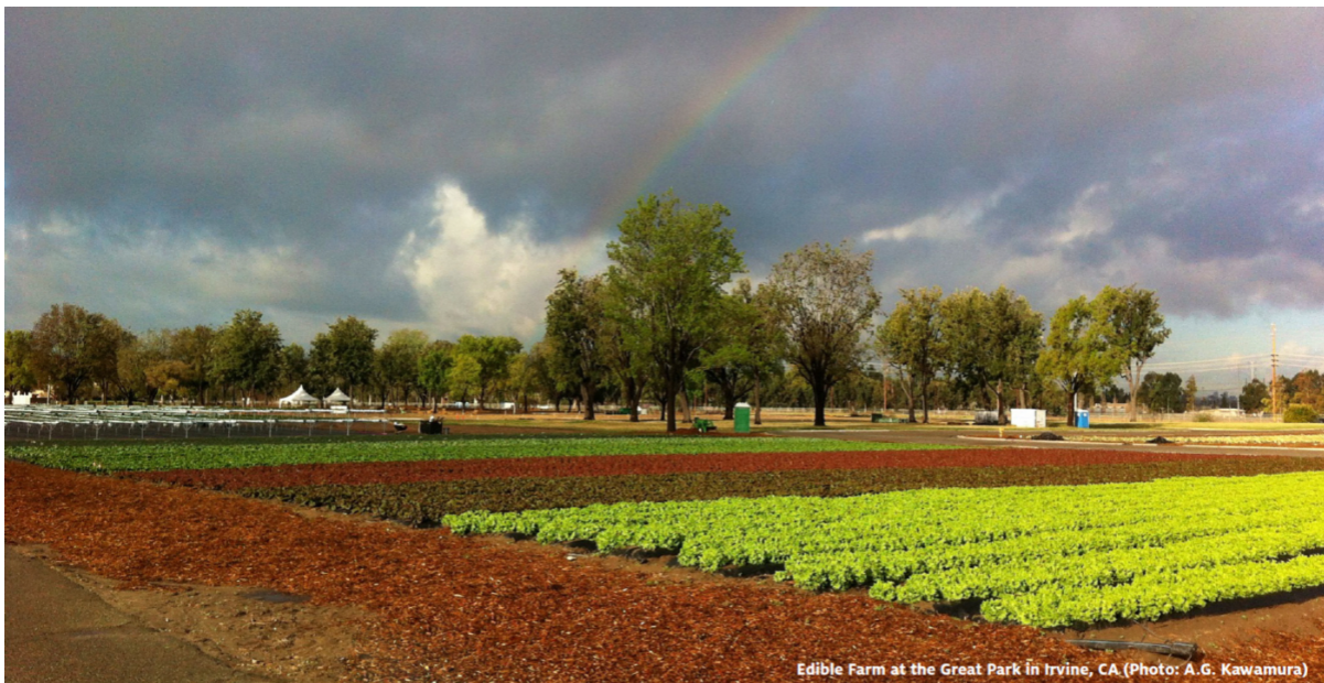
Edible Farm at the Great Park in Irvine, CA

IN THIS ISSUE: Reflections, AACD, ADEQ, APW, Online Resources, Tucson Water