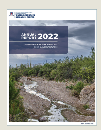
ANNUAL REPORT More information and metrics can be found here.

93 PUBLIC INQUIRIES submitted and answered via WRRC-Extension's online information request form