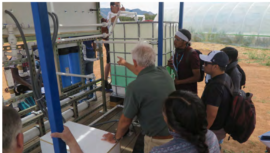
Figure 2. Diné College students undergo training on the solar water unit, with the greenhouse in the background.

data-driven decision support tools. The Indige-FEWSS partnership engages community members and high school and tribal college students in FEW learning (see Figure 3). Civic engagement builds upon prior collaborations with the Navajo Nation, including the