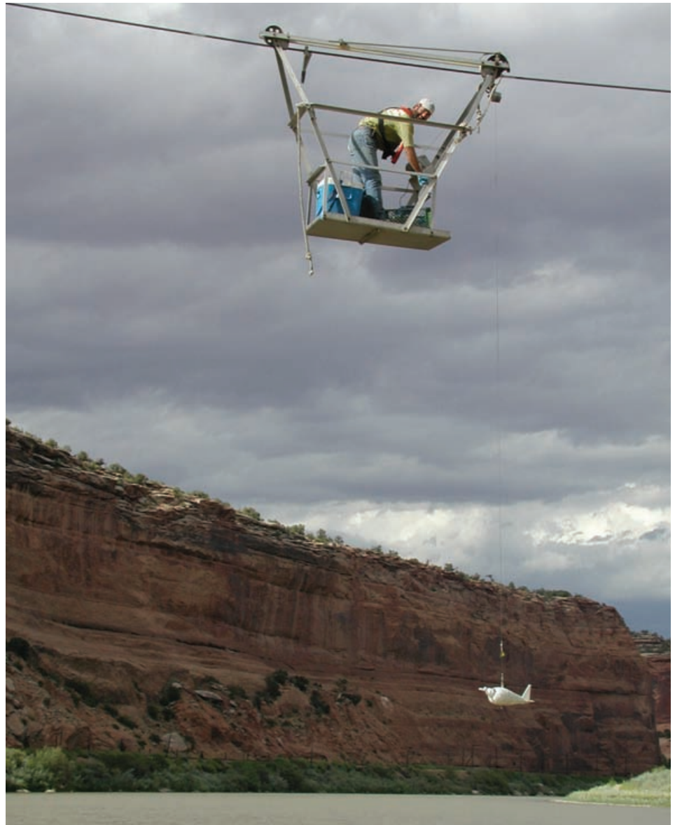
A U.S. Geological Survey scientist collects a sample from the Colorado River for analysis of dissolved solids and other water-quality constituents.

Major water supplies support significant economic and cultural activities in the Southwestern United States. These water supplies include the Colorado River, the Rio Grande, their tributaries, several smaller rivers, and basin-fill aquifers, such as the Rio Grande aquifer system, Basin and Range basin-fill aquifers, and California Coastal Basin aquifers. All water naturally contains dissolved solids as a result of the weathering and dissolution of minerals in soils and geologic formations. Major ions, such as bicarbonate, calcium, chloride, magnesium, potassium, silica, sodium, and sulfate, constitute most of the dissolved solids in water and are an indicator of salinity. High concentrations of dissolved-solids in water, generally those greater than 500 mg/L, can degrade a water supply's suitability for certain uses. For domestic, municipal, and industrial users, high concentrations can result in objectionable taste to drinking water; greater water-treatment costs, increased use of detergents and soaps, and the encrustment or corrosion of metallic surfaces and associated reduction in appliance or equipment lifespan. For irrigation users, high concentrations can result in decreased crop production or crop death, and thus, decreases in economic returns.