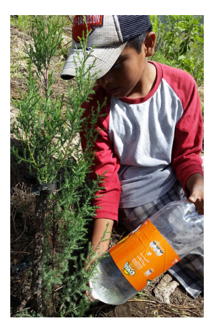
Elementary school student learning about planting and watering trees during a schoolwide reforestation event.

It was apparent early on that water would be a major issue that would weave throughout many aspects of my service. How do you discuss health practices, hygiene, or nutrition if there is no water available in the school or in nearby communities? My host family and I only received water in our home once every three days for one hour in the morning. We would store this water in a large concrete tub and then use it for cooking,