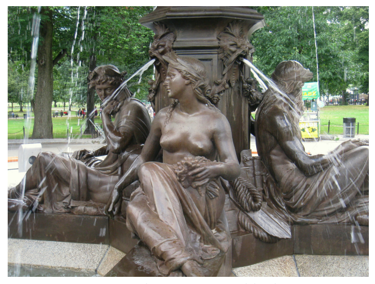
Brewer Fountain, Boston.

With that in mind consider the words of Lucius Annaeus Seneca (4 B.C.E. – 65 B.C.E.): "Where a spring rises or a water flows, there ought we to build altars and offer sacrifices."