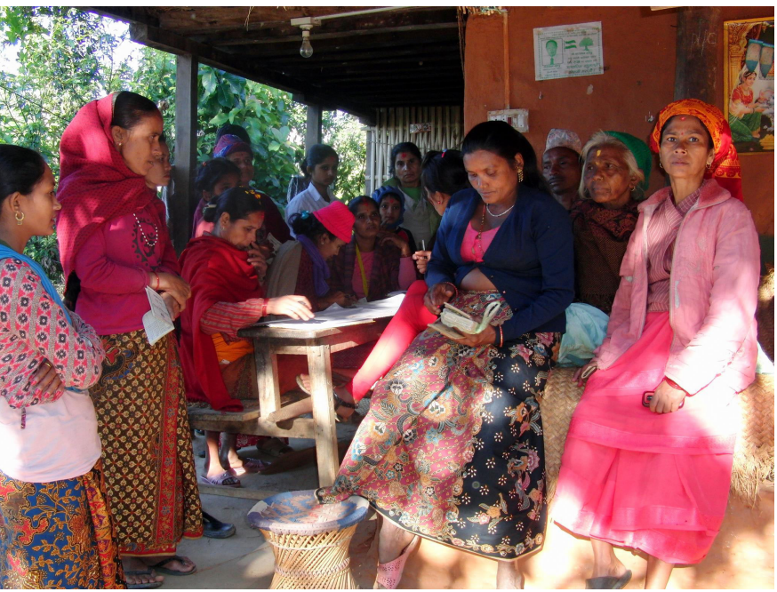
Kanchenjunga Mahila Samiti (Kanchenjunga Women's Committee) Savings and Loan Group.

a Village Development Committee (VDC). Tols conduct monthly development meetings and each year the municipality provides funding for development proposals that can be in one of four areas: electricity, irrigation, drinking water, or road development. Throughout months of interviews, informal conversations, and focus group meetings, nearly every woman I asked said that Higuwa's greatest development concern was water, either