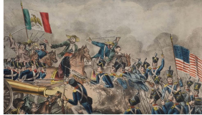
The U.S.-Mexican War, 1846 - 1848