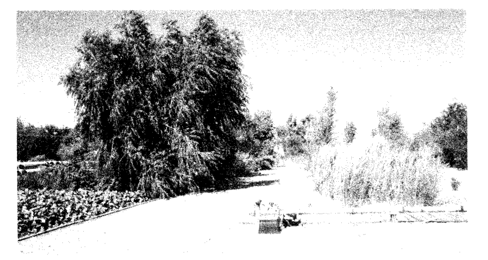
Varied vegetation thrives at CERF wetlands. At bottom left is a floating aquatic plant system with water hyacinths. Next to the hyacinths are two-year-old willows, and cattails are bottom right. Willows and cattails are on a subsurface wetland system.

(Tours of the CERF can be arranged by calling 520-293-2103.)