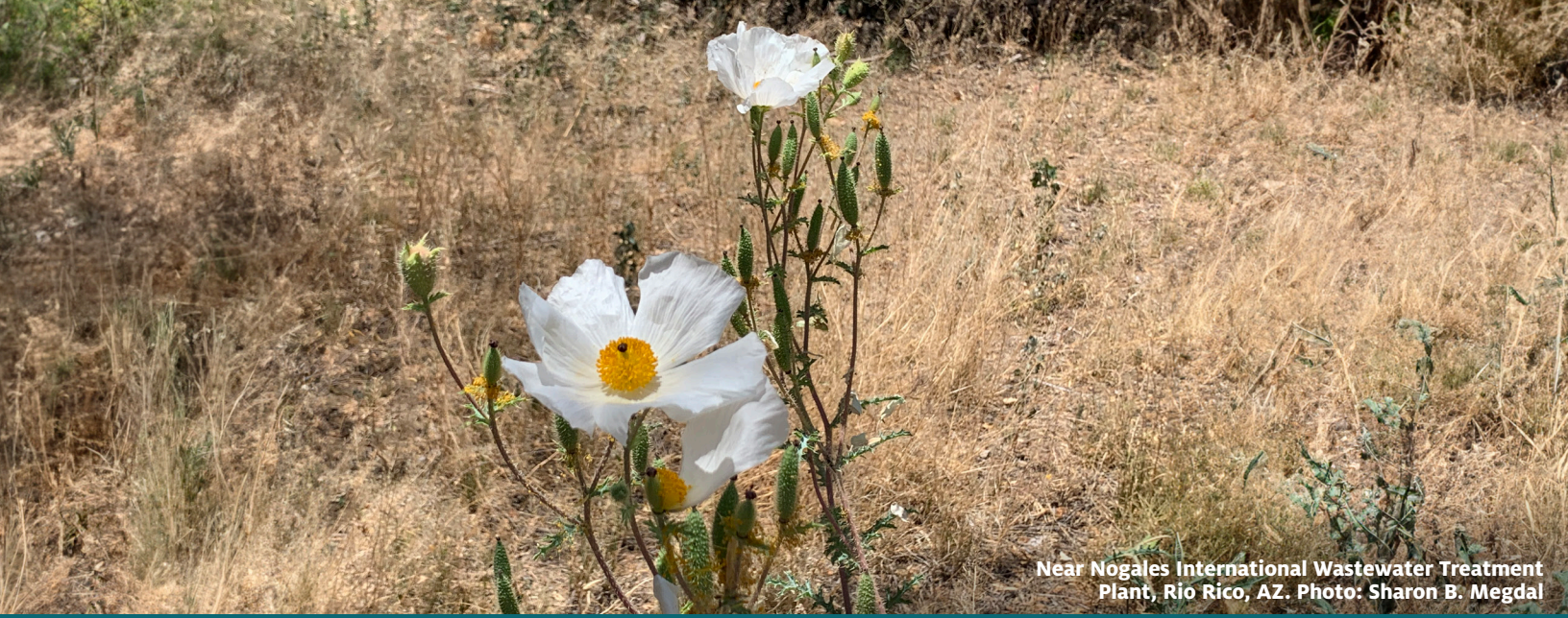
Near Nogales International Wastewater Treatment Plant, Rio Rico, AZ.