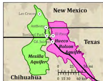
Transboundary Aquifer Assessment Program Aquifers of Focus.

that each country is free to undertake its own studies when such are limited to one side of the border.